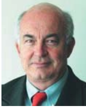
Prof. Kemal Dervis Adviser to the Scientific Bureau Brookings Institution

Prof. Kemal Dervis is former head of the United Nations Development Program and current Vice President and Director of Global Economy and Development at the Brookings Institution. As a specialist in development issues and with a deep insight into the policy issues of the Mediterranean countries, Prof. Dervis is associated with this project to provide advice in the formulation of the general and strategic directions of MEDPRO, and to contribute to the review of geopolitical issues and the formulation of policy conclusions in consultation with the members of the Scientific Bureau.