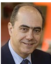
Ambassador Senen Florensa I Palau Scientific Bureau, IEMed team leader IEMed

Her main areas of specialisation are macroeconomic analysis and labour market research. During the last 20 years, she has been heavily involved in conducting economic surveys. The fields of research varied and included several topics such as labour market research projects, micro and small enterprises surveys, empirical studies on industrial enterprises especially in the areas of textiles and electronics, industrial complexes/clusters. In the last seven years, she became engaged in socio-economic household surveys and socio-economic and political polls.